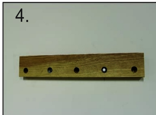
4. Fix all the screws firmly in the 5 slots provided