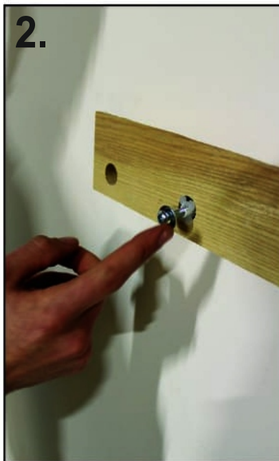
2. Thread the metal screw through the plastic washer until it threads till the wall