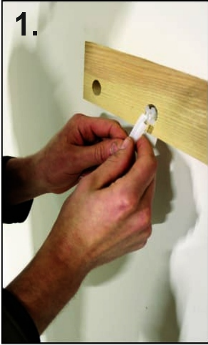
1. Insert the plastic dry wall anchor inside the hole drilled into the wall through the wooden support

ITEM DESCRIPTION : WALL MOUNTING 2 DRAWER CONSOLE